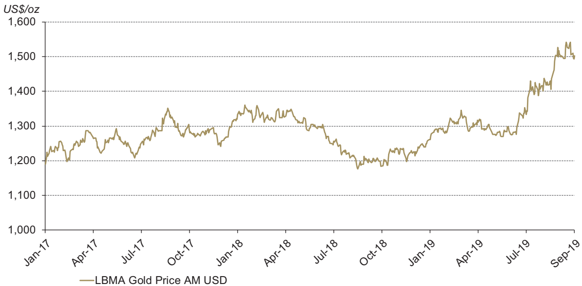
LBMA Gold Price AM – Jan 30, 2017 to Sep 12, 2019

The following chart shows movements in the price of gold based on the LBMA Gold Price AM in U.S. dollars per ounce over the period from January 30, 2017 (the first date GLDW Shares began trading on the NYSE Arca) to September 12, 2019 (the date GLDW was liquidated).