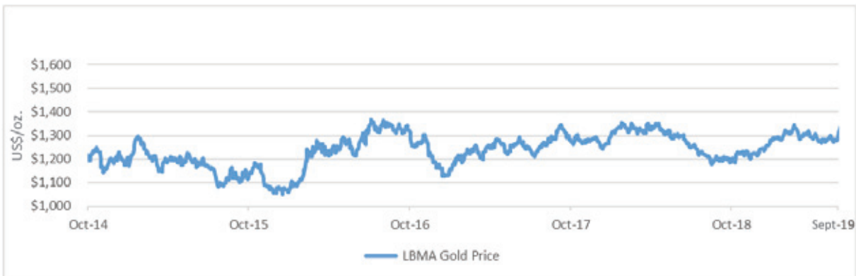
Daily Gold Price – October 1, 2014 to September 30, 2019

During the year between October 1, 2018 and September 30, 2019, the gold price based on the LBMA Gold Price PM traded between $1,185.55 per ounce (October 9, 2018) and $1,546.10 per ounce (September 4, 2019), and the average price was $1,329.69.