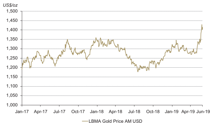
Daily gold price – January 30, 2017 to June 30, 2019 LBMA Gold Price AM USD