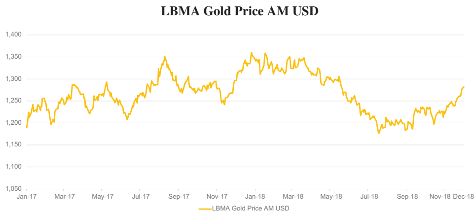
Daily gold price – January 30, 2017 to December 31, 2018

The following chart shows movements in the price of gold based on the LBMA Gold Price PM in U.S. dollars per ounce beginning June 26, 2018 (first day Shares of GLDM began trading on the NYSE Arca) through December 31, 2018.