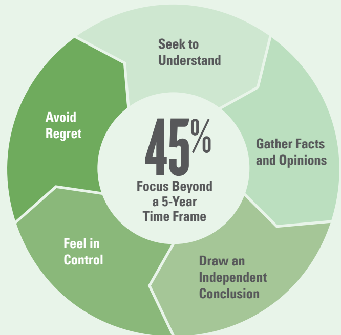
Source: State Street Global Advisors' survey, "Assessing the Landscape: Female Investors and Financial Advisors," 2015.