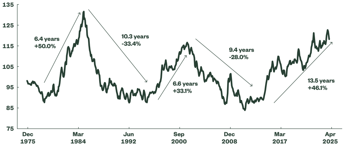
Figure 2 Real Trade-Weighted US Dollar Index The US Dollar is Expensive!